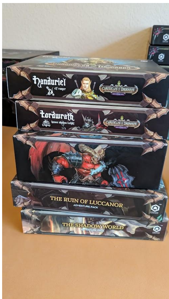
Wave 1 Boxes you can get rid of

Boxes you can get rid of by using the new trays from wave 2